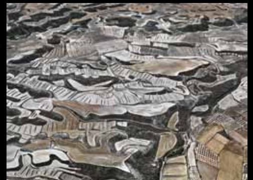
Edward Burtynsky Dryland Farming #13 Monegros County, Aragon, Spain 2010 20" x 26" Chromogenic color print Edition of 25. $3,500 mounted.

EDWARD BURTYNSKY ART TORONTO 2011 MOCCA BENEFIT EDITION: To be sold exclusively at Art Toronto 2011.